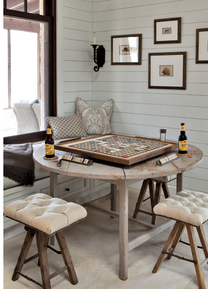
In a cozy corner of the living room, an antique French table from the Marburger Farm Antique Show provides a place for matching wits over a board game. The tufted antique stools from 2 Lucy's are topped with a neutral fabric.

Texas with a bit of German influence," he says. "We added Lueders limestone patios for entertaining and, closer to the river, we used Brazilian hardwood ipe decking, bridging it over the root systems to protect the cypress trees."