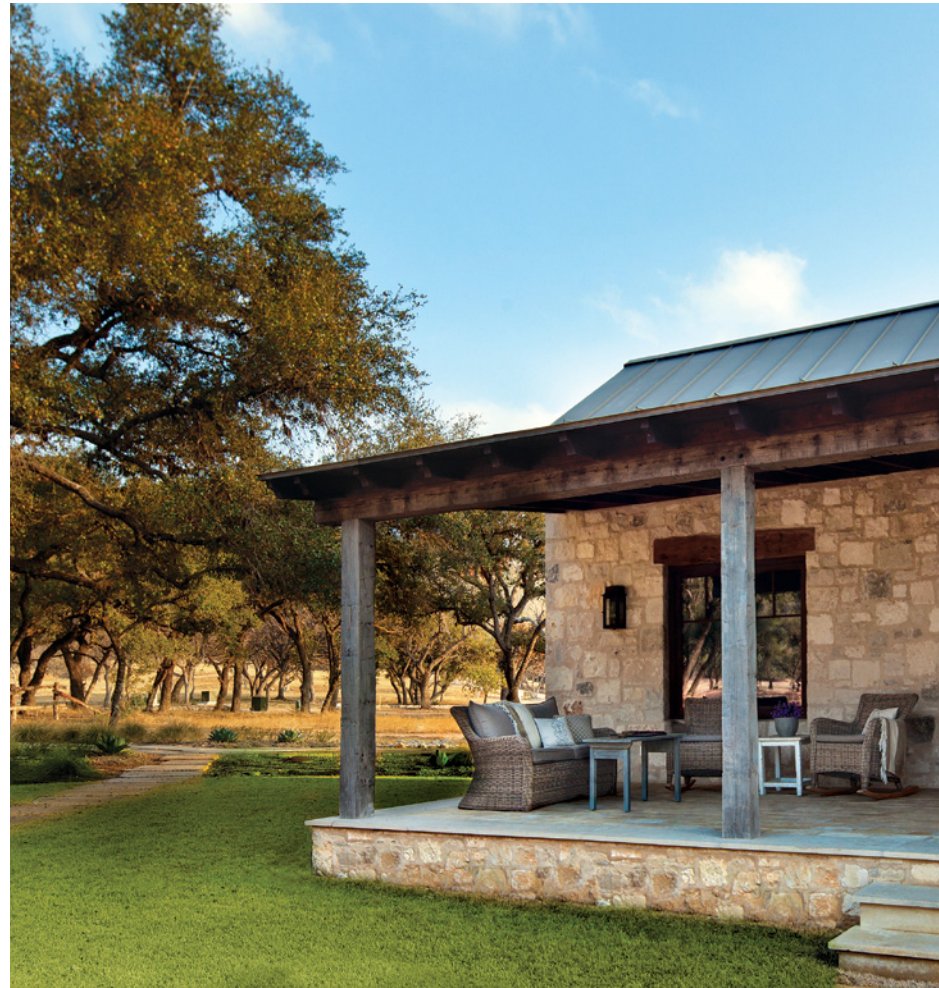
Stone porches supplied by Hill Country Stone offer dazzling views in every direction, and deep overhangs allow for shade and capture the cool river breeze. The family spends much of their time outdoors, relaxing on the porches, swimming in the river, and hiking the area's trails.

In the main house, the spaces flow effortlessly with open alcoves. The porches are deep to protect the areas from the hot Texas sun yet the interior remains airy. "We added a ridge skylight in the center of the gathering area to let some light in," Shiflet explains. Rustic building materials give the home a camp-like feel. "The timbers are from an old Vermont barn," Dalgleish says. "Some floors are made of local quarried stone, and in all the sleeping areas, the floors are reclaimed oak from nearly 100-year-old fencing found mainly in Kentucky and Tennessee."